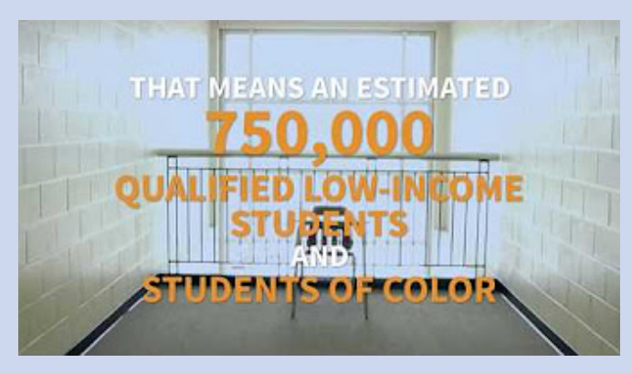
Click image to watch